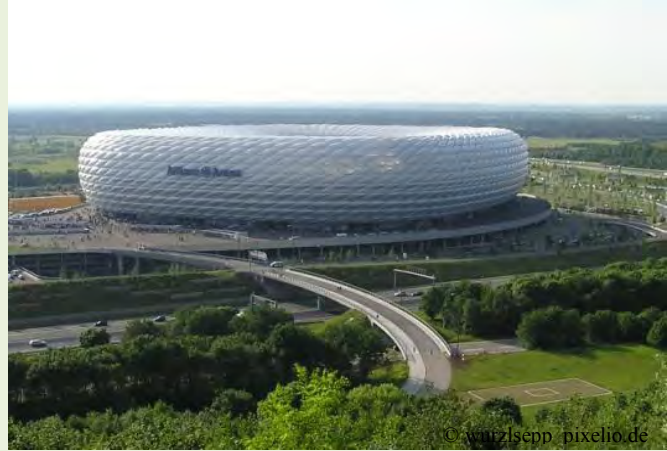
Allianz Arena in Munich

Areas with a high rate of foot traffic such as event locations, airports, and fairgrounds pose a special challenge to fire protection efforts. Many fixed gas extinguishing systems must make provisions for forecast lead times. Sprinkler systems together with a combination of fire protection measures related to construction and organisation have proven themselves in practice, notably the Düsseldorf airport (Germany), the Nuremberg fairgrounds (Germany), and the Allianz Arena in Munich (Germany) (1).