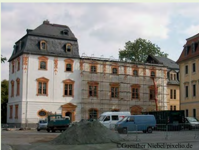
Anna-Amalia library in Weimar

As a rule, hand-held fire extinguishers are in place at libraries and museums to fight a fire in its initial stage. The extinguishing agent is CO 2 . The particular problem at these locations is the timely identification of a fire that occurs