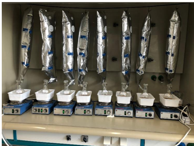
Photo: silylation workstation at Fraunhofer IME