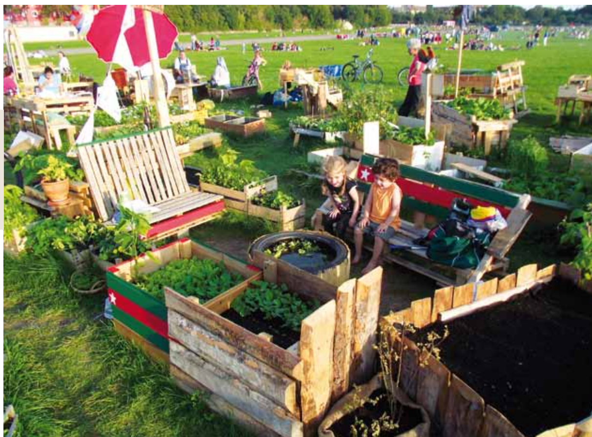
Garden design at Allmende-Kontor Berlin