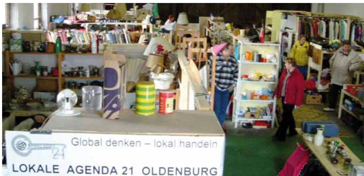
Market for donated goods, Oldenburg