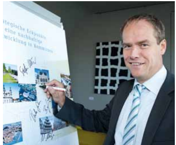
The mayor of Heidelberg sets out the strategic corner points for strategic development in communities to the Council for sustainable development.

With the title “Much achieved, more to do”, the communities and local actors refer in the Rio+20 Declaration to the principle that sustainable development must occur above all at the local level and that the deep changes it effects should also be measurable. The necessary social and environmental shifts in the economy and society can only be achieved by the joint efforts of policy-making, administration, business and civil society, and such efforts should