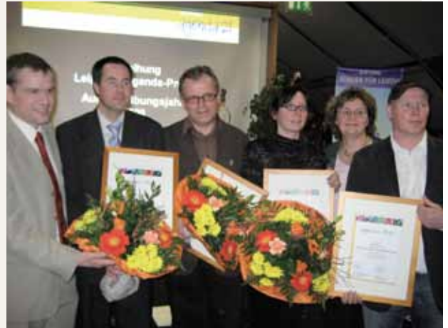
Presenting the Leipzig Agenda Prize, 2009

As a mark of appreciation for the hard work put in by many local actors and also to maintain efforts in the long term, the city has awarded an Agenda Prize in various categories since 1999. The prize is awarded in cooperation with the city's utilities (Stadtwerken Leipzig GmbH), Verbundnetz GAS AG (VNG), the Leipzig savings bank (Sparkasse Leipzig) and the "Citizens for Leipzig" foundation. As well as the public recognition, the prizes involve sums of money that are used by civil society initiatives to implement further innovative projects. The Agenda Prize is used in Leipzig to promote working together with migrants. In 2001 the Brückenschlag (Bridge-building) association