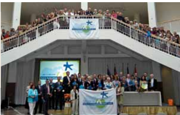
Signing the Magna Charta Ruhr.2010 against exploitative child labour, 12 June 2010, Dortmund Town Hall

Sustainable procurement and fair trade are closely interdependent. Aided by community resolutions and public-sector functions linked to them, the two issues can be beneficially combined. This also enables towns and cities to credibly promote changed consumption patterns for people in their domestic lives.