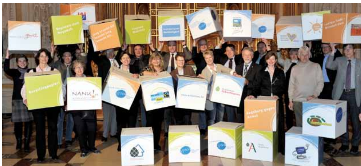
Agenda building blocks of the city of Augsburg

A degree of emulation is possible and worthwhile – for the people of today and in the future. ■