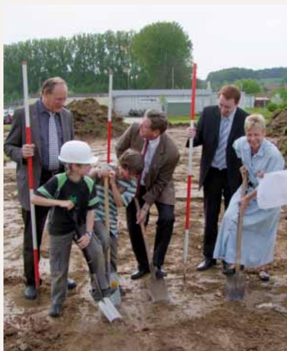
Ground-breaking ceremony for the construction of the multi-function area