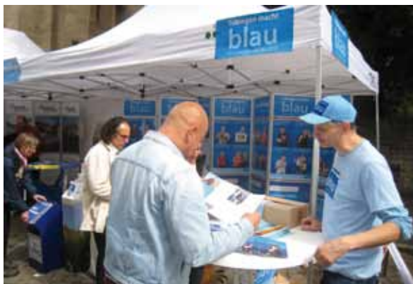
Energy consultancy information stall in Tübingen

When it comes to a complete changeover of power sources to renewable energy, small municipalities in rural areas often play important roles as initiators. They generally have the advantages of good neighbourhood relations, an emotional involvement with their town or village and can discuss new ideas at a direct personal level. The empirical knowledge gained by these innovators is indispensable for the energy transformation and is in demand even from other countries.