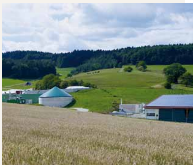
PV installation and biogas plant with combined heat and power unit in Mauenheim, the first bioenergy village in Baden-Württemberg

In cities and towns the construction of wind farms or biomass plants – as with other large construction projects – can be met with resistance from local people. Experience indicates that involving the local people at an early stage of the planning phase creates a constructive climate for discussion and can also contribute to conflicts of interest being resolved. There is a wide range of methods for this. One result of joint planning of this kind may for example be the formation of a community company or even a “community wind turbine”, financed by the residents and local traders and whose returns remain in the region and flow back to the local investors. ■