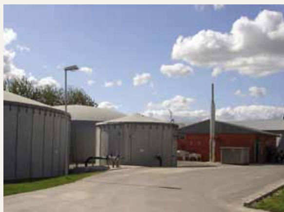
Biogas plant in Feldheim