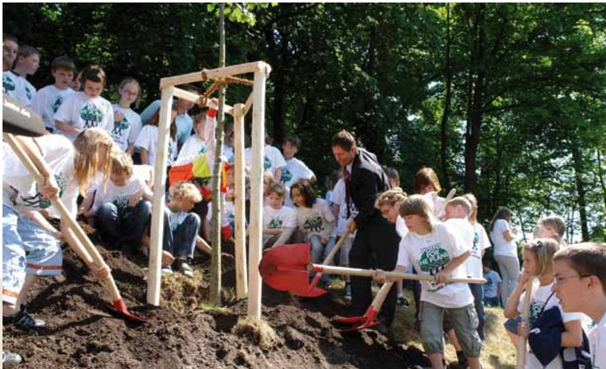
Eighty children, together with the mayor, plant trees in the Neumarkt city park as part of a "Plant for the Planet Academy", giving a clear sign for greater climate justice

Sustainability can only become really effective when it is lived by people in the community. Communities provide the necessary space for experimentation in this. It is also important to support participatory processes and to give recognition to the participants and grant them distinctions where appro-