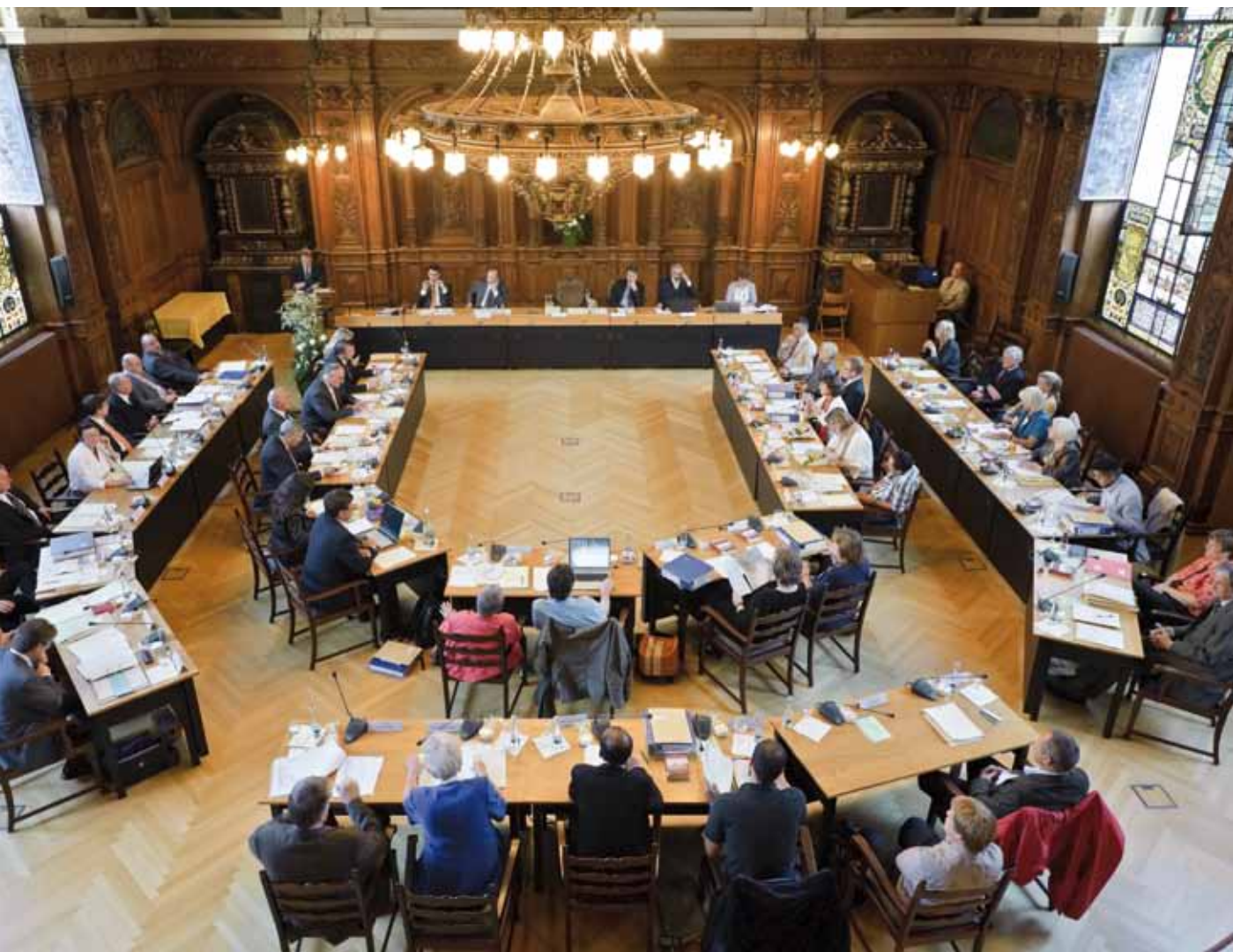
Session of the Heidelberg local council