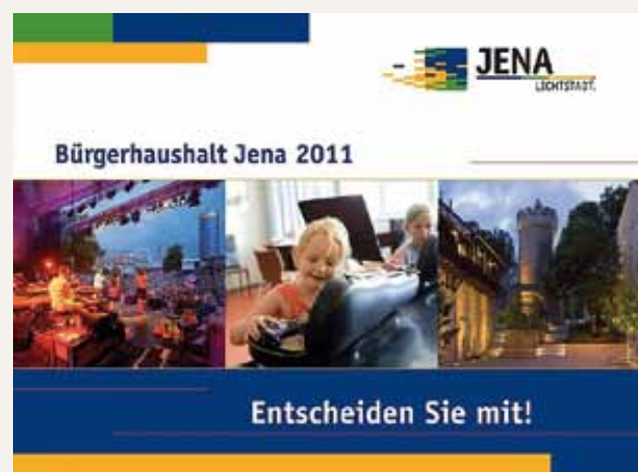
Title page of the 2011 Jena participatory budget