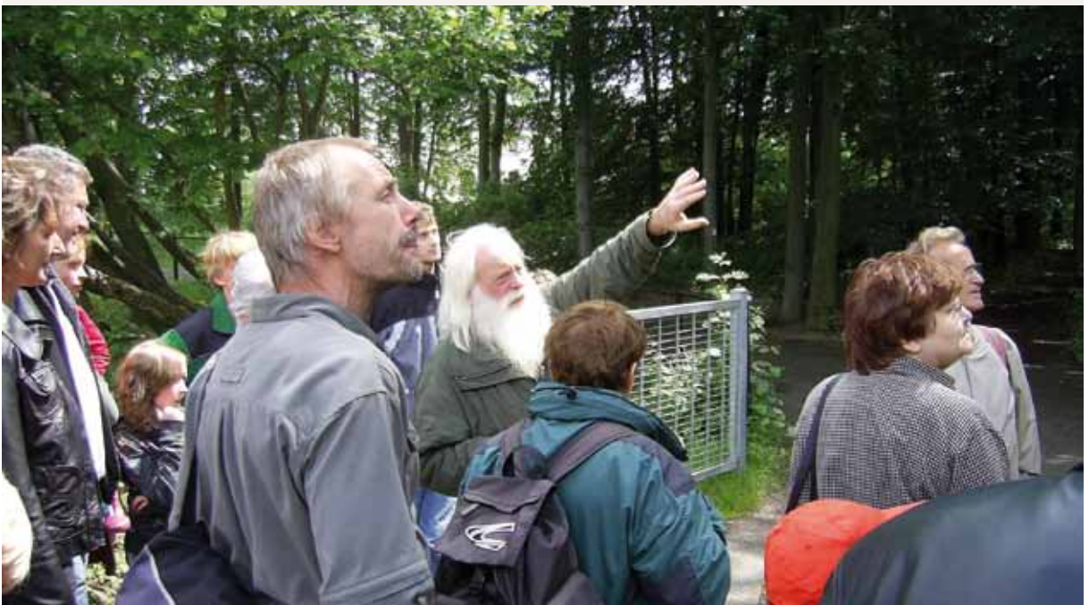
Visiting a reference area in the Crimmitschauer Wald with a forestry educator