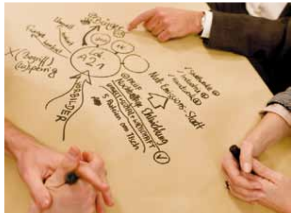
World Café, part of the 5th Netzwerk21Kongress in Hanover, 2011

In Germany too, communities are affected by some of these generally complex problems, and people and decision-makers at local level are experiencing ever more frequently that a solution with conventional strategies and resources is barely possible. At the same time, however, local actors have the necessary experience and potential at hand to open new ground and to confront these challenges. Experience gained from practice demonstrates that in numerous cities and municipalities the local people are seizing opportunities, setting up sustainability activities and experimental projects and thus are also introducing important learning processes. The activation of involvement by civil society plays an important role here, for example in solving social problems, in culture and education or by conservation of resources and the use of renewable energy sources.