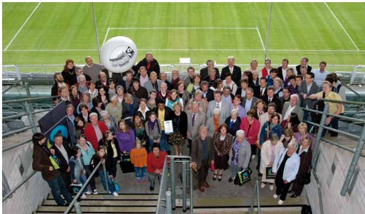
Awarding of the 2009 Fairtrade City Dortmund prizes in the Signal Iduna Park

Communities can use the area of public procurement as an example for private consumers, say, by opting for green electricity, improving the energy performance of a building, purchasing energy-saving office equipment or stocking their canteens with regional, organic, fair-trade produce.