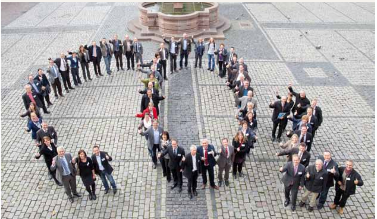
Founding the German "Covenant of Mayors" club in Heidelberg, 2011