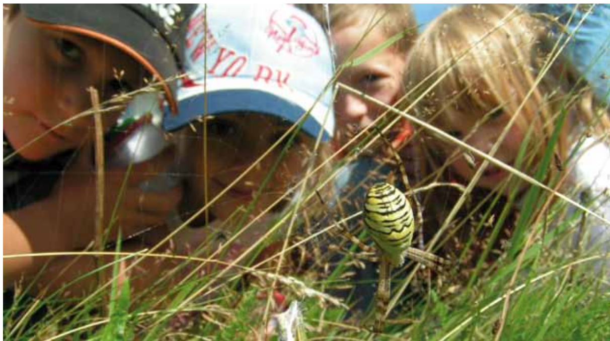
Children on a nature learning expedition