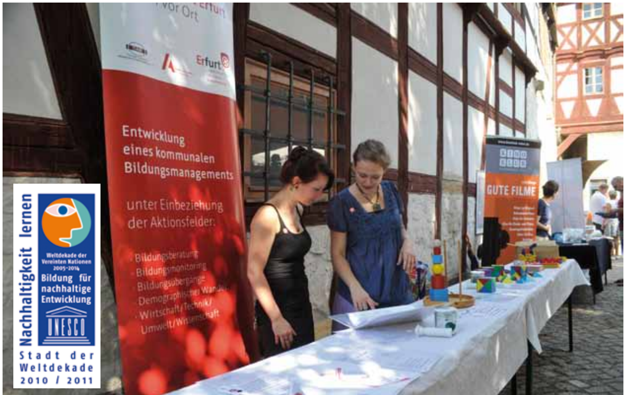
Erfurt Citizens' Festival 2011: the city presents itself as a centre for education