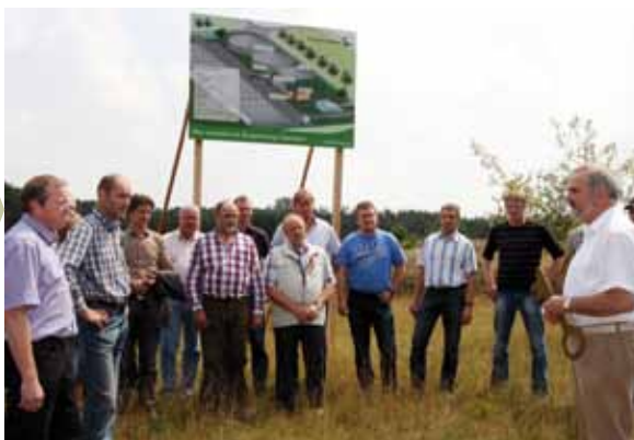
Handing over the keys of the biogas plant to the farmers in Saerbeck

A comprehensive and coherent transformation strategy for the energy system requires a large number of instruments and concepts, such as improving the energy performance of older housing stock, the funding of energy-efficient new buildings right through to plus-energy homes (that are net providers of energy), converting the power generating system to renewables or changing the power supplier to a renewable source; and measures to build consciousness and to change habitual use patterns.