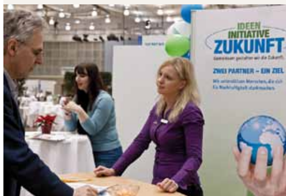
Ideas, Initiative, Future is presented at the 5th Netzwerk21Kongress in Hanover

This signal effect can also be passed on to dm’s customers, who can change their domestic supply to green electricity with a starter package from EWS in the Black Forest or LichtBlick in Hamburg. When the customer signs up, he or she also receives a dm gift card worth €50. Since the starter packages were introduced in 2011, 3,200 households have changed over to green electricity by this method. www.projekte.ideen-initiative-zukunft.de