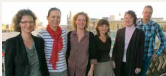
The “Buying the Future” project team at the Institute for Church and Society of the Protestant Church of Westphalia

A sustainable procurement system is being introduced step by step with the support