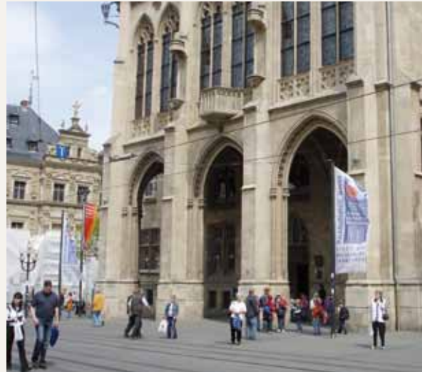
Erfurt Town Hall with “Education for Sustainable Development” flags

Erfurt is striving to become an innovative education centre and place for lifelong education in the coming years. The linking element is the aim of establishing educational landscapes. Starting from a mission statement for education in which education for sustainable development is firmly