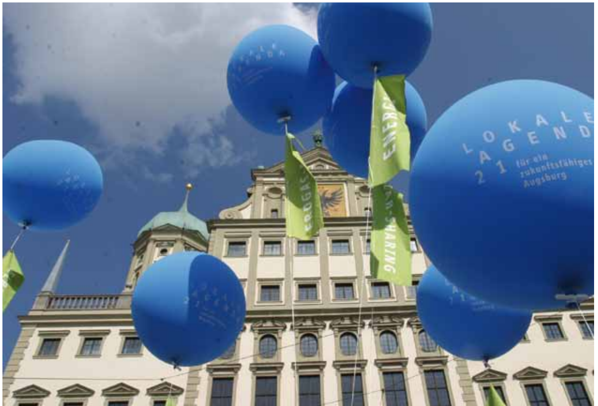
Agenda 21 initiative in the town hall square in Augsburg

A further possibility for anchoring participation also at a strategic level for developing and implementing sustainability goals is to introduce a sustainability audit of council proposals. This new local policy instrument of a sustainability audit is made plausible by the trend in which such audits are being carried out both at the regional level of Baden-Württemberg and in the federal government and the Bundestag (parliament), and more and more local government bodies are expressing interest in the concept. Because of the importance of monitoring and evaluation for an effective reorientation towards sustainability, the instrument of sustainability auditing will in future become more important still. ■