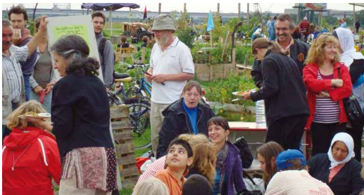
Picnic and land use planning at Allmende-Kontor, a pioneering space on the site of the former Tempelhof Airport