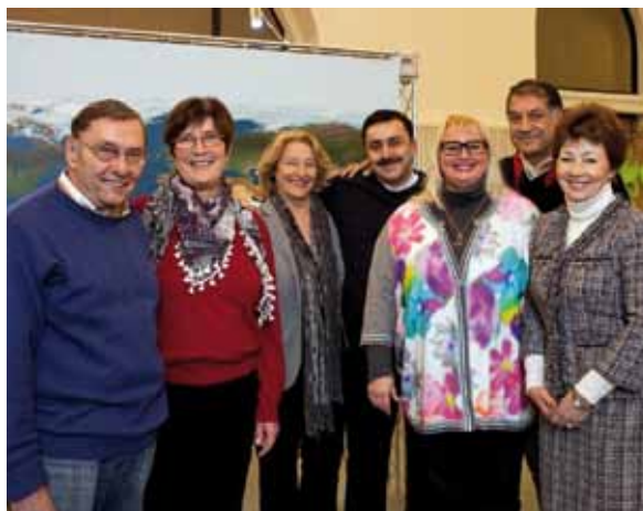
Integration facilitators in Hanover are also qualified as environmental facilitators, in cooperation with the Lower Saxony regional capital's Agenda 21 office