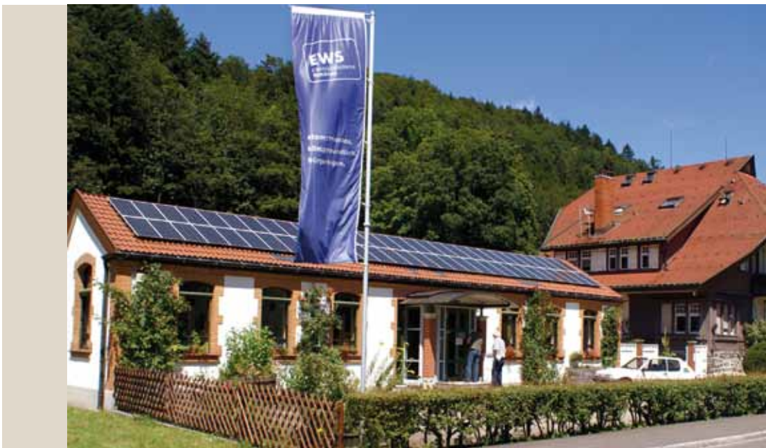
Company offices of Elektrizitätswerke Schönaue (EWS)