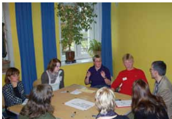
"Participatory budgets: experiences and prospects", an event in Weimar in 2011

In maintaining a participatory budget, only the voluntary actions of a community can generally be influenced. Therefore only areas of expenditure that are not prescribed and tied by law can be discussed and agreed within the participatory budget.