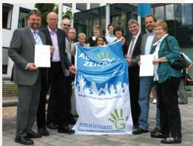
The Climate Protection Flag is presented to the Barlach-Gymnasium and the Berufskolleg Werne by LAG 21 NRW and the local climate alliance of the Unna district during the “Together for Climate Protection” campaign

The annual nationwide Netzwerk21Kongress mentioned above, which has taken place since 2007, is also funded by a wide spectrum of actors and is organised each year by a different community. This two-day congress serves as a platform for exchange, learning and networking for local sustainability initiatives and makes available documentation and working materials via its own online portal. During the congress, particularly committed actors from communities, companies and civil society are given special recognition and presented with the “ZeitzeicheN” (“Sign of the Times”) Prize. The congress is funded by the Fed-