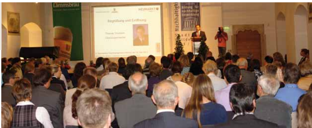
Neumarkt Sustainability Conference

priate. Appreciation of citizen participation is particularly important in order to retain and renew motivation in the long term. Many communities, for example, award an Agenda 21 or sustainability prize in recognition of the work done on their behalf.