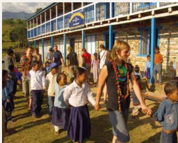
Pupils from Gati and Freiberg together outside the school