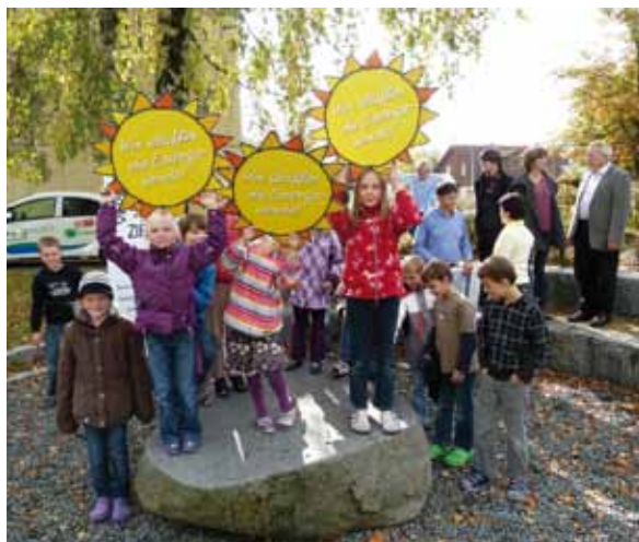
School project on energy transition in the Fürstenfeldbruck district – the children playing an active part

In Germany the German Advisory Council on Global Change (WBGU) has therefore proposed a new “Social Contract for Sustainability”. The “great transformation” that this implies will take place, and be felt, primarily in towns and cities. That is where consumption and emissions are particularly high, but the potential for change and redesign are greatest (see WBGU: “World in Transition – A Social Contract for Sustainability”, Berlin 2011).