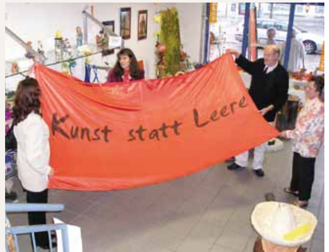
Art not Emptiness – opening the 2008 exhibition