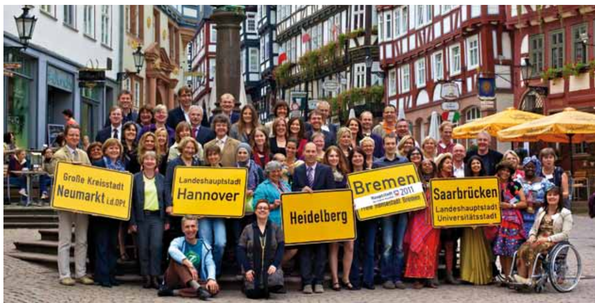
Winners of the 2011 Capital of Fair Trade competition in the old town district of Marburg

One of the 2011 prize-winners is the town of Bollewick, situated in Mecklenburg-Western Pomerania. Here a functioning cooperation network has been set up that is paving the often difficult way towards a low-carbon bioenergy village. Since 2009, sixty-eight municipalities and various organisations have joined the network. As the network continues to grow, the entire region benefits and environmental protection is actively boosted.