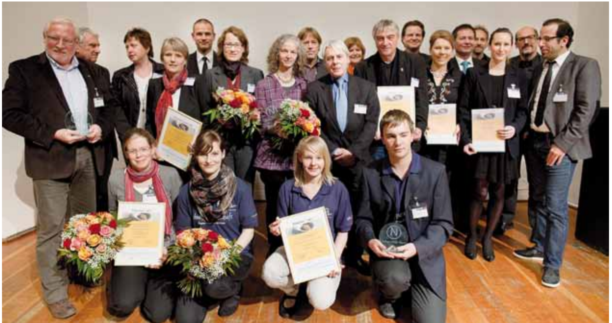
Winners of the 2011 ZeitzeicheN Prize at the 5th Netzwerk21Kongress in Hanover

By inviting entries in different size categories, more medium-sized and smaller communities are also attracted to participate and to gain recognition for their years of hard work.