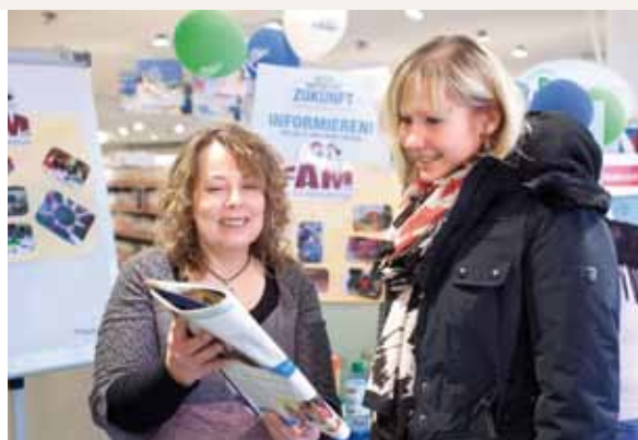
Presentation of the “Open Meeting Point” project in a dm shop in Bretten, project representative and dm customer discussing the special issue of “alverde”