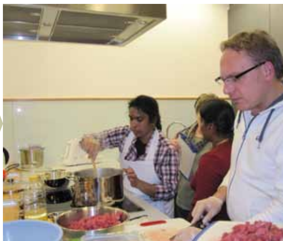
Culture Kitchen Aalen – cooking Tamil dishes together

Intercultural cooperation works best when people work together to build and shape something, and in doing so are able to communicate their own culture and develop an understanding for other cultures. Low-threshold access approaches such as the cooking and gardening sessions make it easier to get started and open the door for more extensive activities.