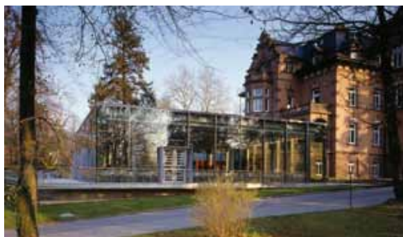
The restaurant of the Protestant Academy Bad Boll

Ecclesiastical bodies that have organised their procurement according to environmental and social criteria often also introduce an integrated environmental management system and thus achieve additional benefits: they reduce the burden on the environment and lower costs. By this means some church organisations become important drivers for change. An example is the Protestant Academy Bad Boll, whose commitment to the region has resulted in local producers of organic produce and thus created a stable environmental value-added chain.