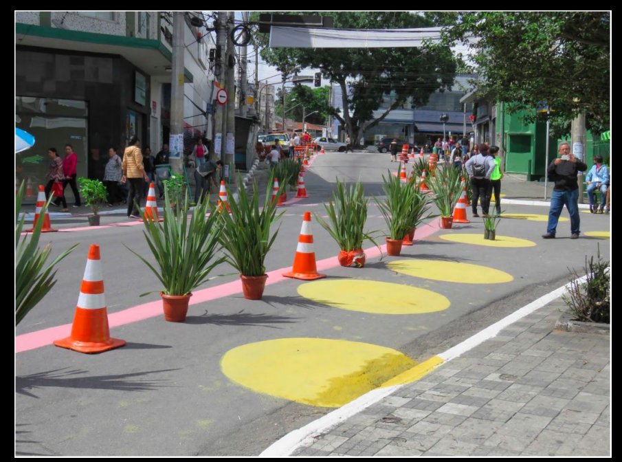
São Miguel Paulista Traffic Calming, ITDP, 2017