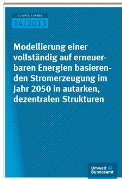
“Local Energy Autarky” (2013)