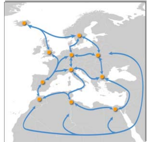
“International Large Scale” (in progress)