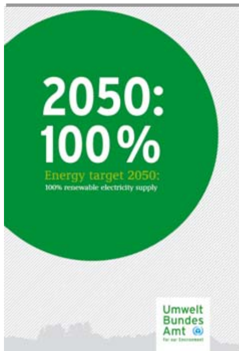
“Regions Network” (2010)