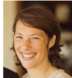
Dr. Audrey de Nazelle Centre for Environmental Policy, Faculty of Natural Sciences, Imperial College London, UK

Health is one of the greatest drivers behind the current interest in promoting walking and cycling in cities. The increasing amount of research indeed highlights the benefits of active mobility, particularly from the gains in physical activity that can be integrated seamlessly as part of daily routines. An important challenge remains in demonstrating and quantifying how specific policies can lead to measurable health benefits using longitudinal data in real-world natural experiments. Generating this type of robust evidence requires strong partnerships between research and practice to design studies and collect data. But perhaps even more important is understanding how the evidence can be translated effectively to engage both politicians and practitioners into creating health-promoting urban designs. Whether through joint funding mechanisms, training, or events, it is essential to create trans-disciplinary partnerships. The goal is for practitioners to come to realize how decisions in their sector may impact other sectors, and to provide incentives for joint solutions which lead to healthier cities.